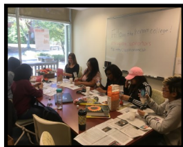
Members of the Honors Club making stress balls.

The Honors Club hosted a fundraiser, "Stress Relief for Puerto Rico," in collaboration with Campus Activities, Service & Leadership's Heart 4 Hurricane Relief Initiative. Club members got together and made stress balls using water bottles and sand. The stress balls were sold on October 24th and 26th